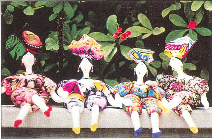
Unique handmade gifts and accessories from around the world. Shown are "Poupees Millet", truly unique works of art which are individually handcrafted and handsewn. With fanciful headdresses and a myriad of exotic fabrics, no two dolls are alike. Each doll is signed by the artist.